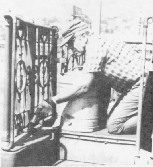
Jack Linn puts finishing touches on rear platform railing of car 1509.