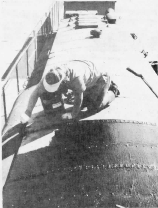
Ken Helm applies new roof to car 1509.

as was previously stated), who arranged the gift.