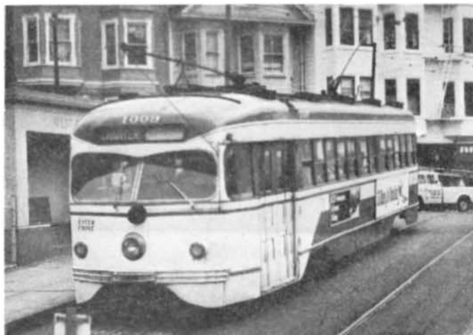
For the downtown portion of our excursion a modern PCC type coach will be used. The coach will be similar to the coach 1009 seen here at the end of the K line. Several photo stops will be made with the coaches during our tour of San Francisco.

Here's a rare opportunity for members and friends of the Pacific Southwest Railway Museum to tour San Francisco over the lines of one of the last operating street railways in the United States.